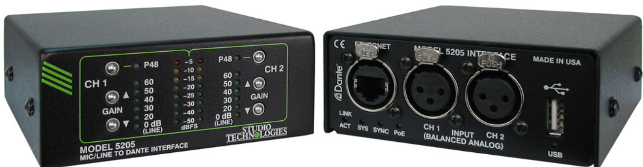
Figure 1. Model 5205 Mic/Line to Dante Interface front and rear views

The Model 5205 is perfect for use in conjunction with a variety of fixed and portable audio applications where one or two analog audio signals need to join a Dante "network." The unit's high-performance audio circuitry allows virtually any source to be handled correctly. Essentially all condenser, dynamic, or ribbon microphones are compatible, as are most balanced and unbalanced analog line-level sources. The